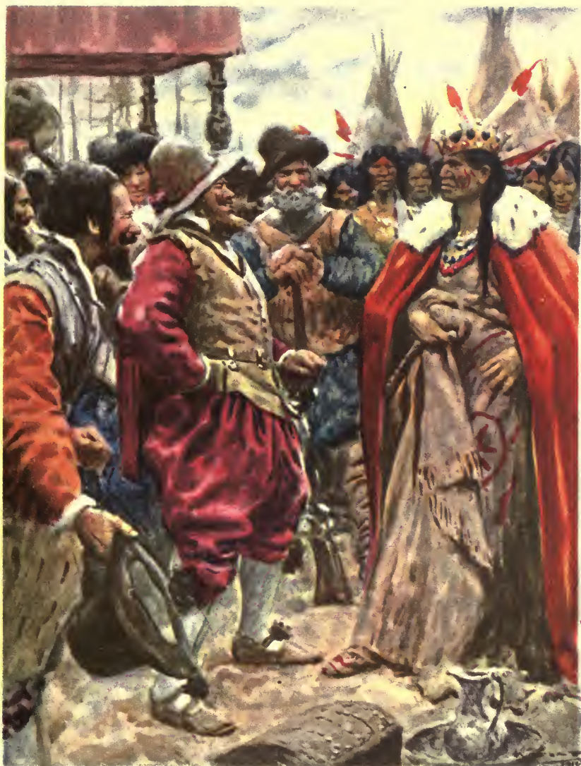
THE CROWNING OF POWHATAN

The Powhatan, they had heard, was a king, a sort of Emperor, . . . they . . . pictured him as living in a stately palace, wearing a golden crown and velvet robes.